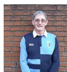
Mel Grover Social Media Web, Email & Followers Posters/Flyers/Leaflets